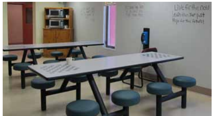
The new facility at the Southern Maine Re-entry Center